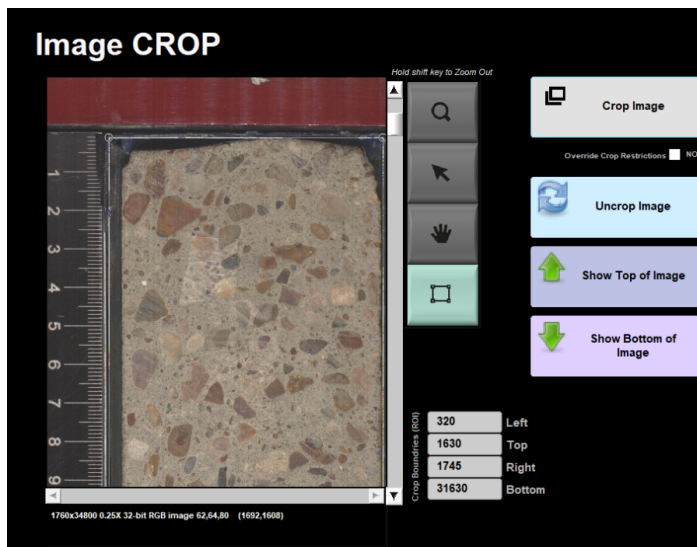
Figure 6. Image CROP window.