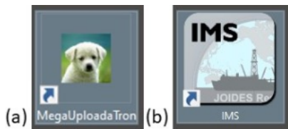
Figure 1. (a) MUT Icon. (b) IMS Icon.