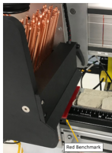
Figure 2. Correct core position.