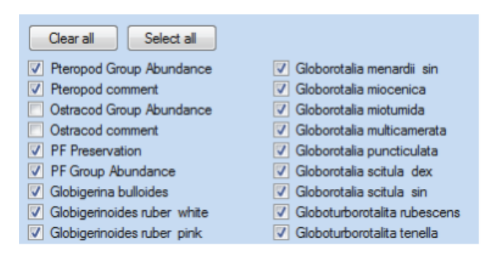
Figure 2. Checked boxes