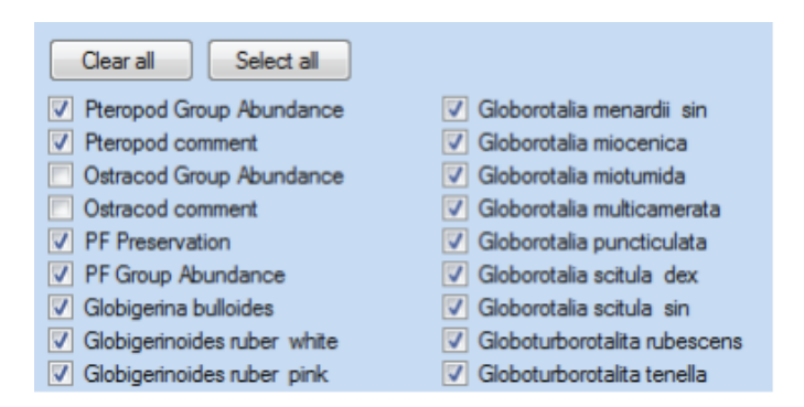
Figure 2. Checked boxes