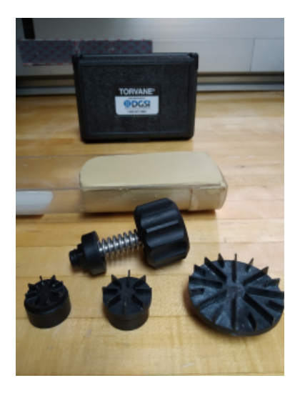
Figure 2. Vane driver and the 3 kinds of vanes.