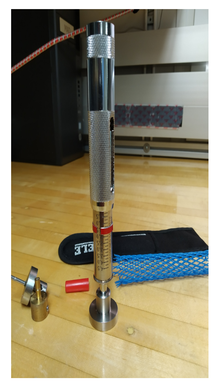
Figure 8. Result at the end of the measurement.