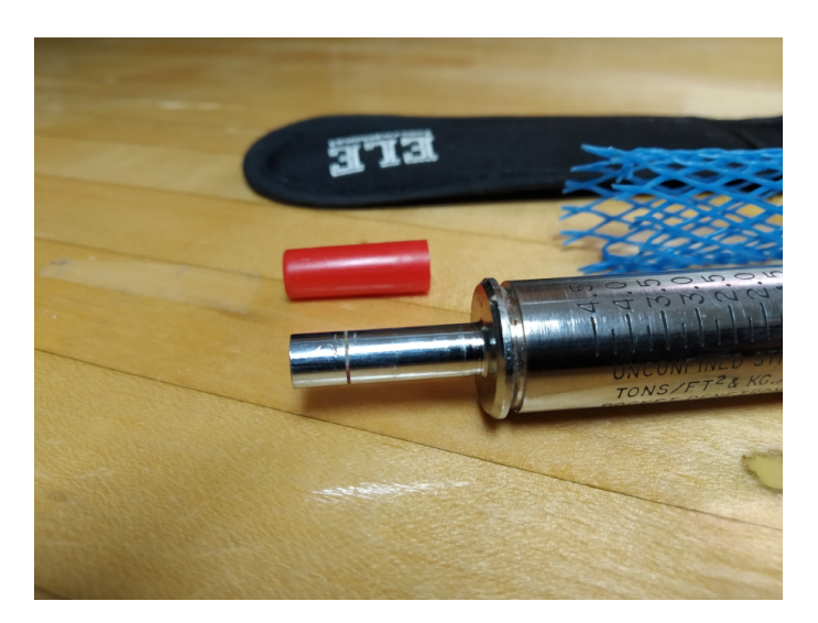
Figure 7. Mark on the tip of the penetrometer.

2. Grip the penetrometer by the handle and push the tip into the soil to the mark located ¼" from the tip (Figure 7).