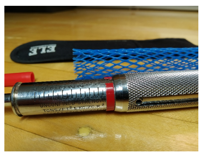
Figure 6. Red-ring in position to start measurement.

1. Slide the red-ring, on the barrel of penetrometer, down against the instrument handle (Figure 6). This ring will hold the maximum reading of the scale, for easy reading.