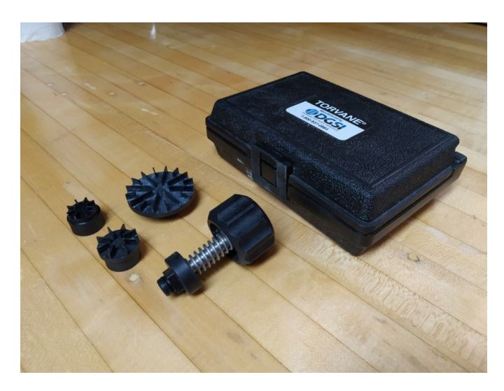
Figure 1. Torvane shear device (ELE International)

• The pocket penetrometer was develop by Soiltest Inc. for use by field engineers to check the visual classification of soils. The readings of the penetrometer were compiled from several thousand unconfined compression tests of silty and clay-like soils.