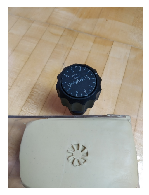
Figure 5. Result at the end of the measurement.

5. After failure develops, release the remaining spring tension slowly and the index mark on the knob will indicate the maximum shear value (Figure 5).