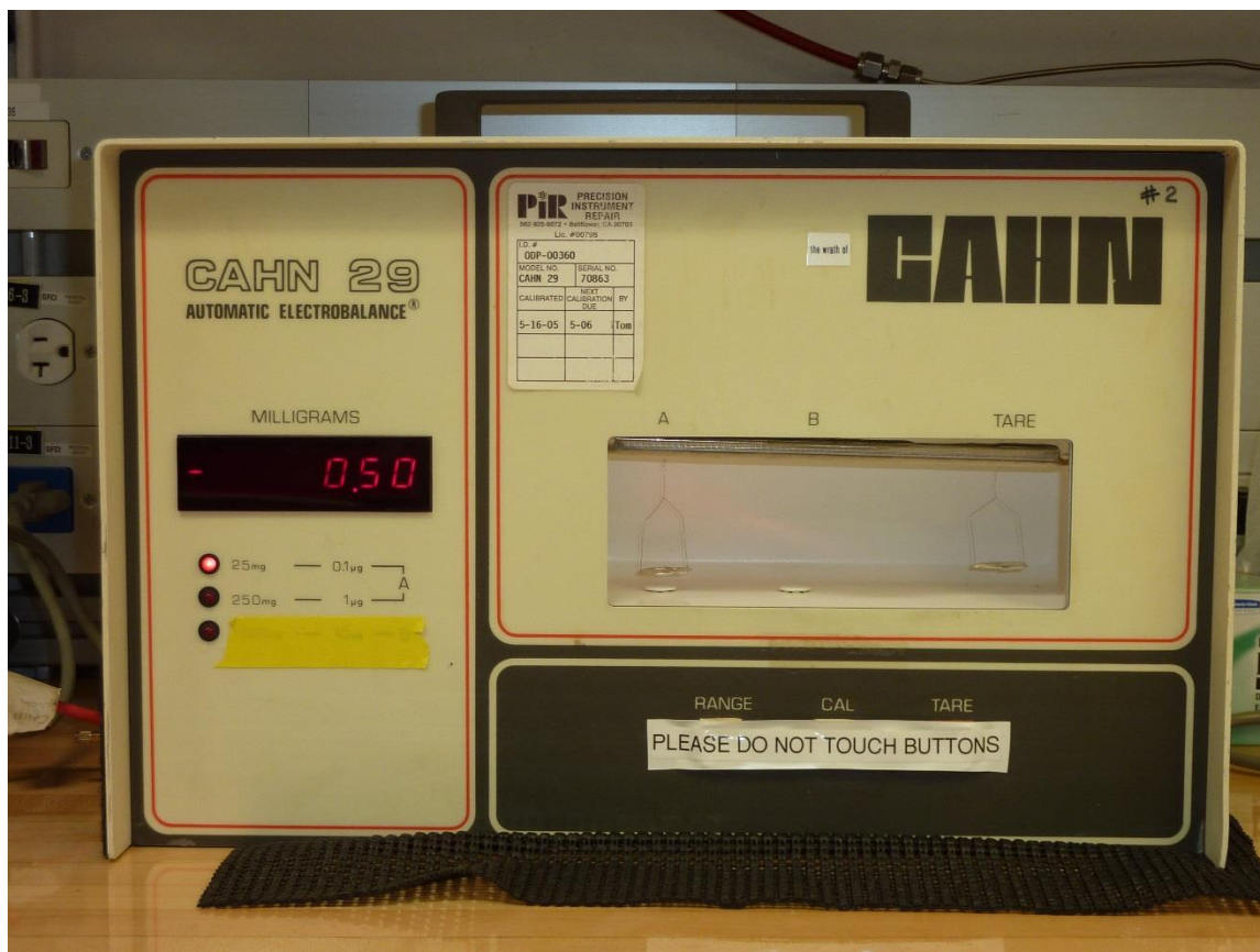
Fig. 1. Cahn Model C-29 Microbalance. For masses 250 mg or less, the unknown pan is hung from the “A” support wire (as shown in the picture). The JRSO does not use the “B” wire configuration for heavier masses.

In the Mettler-Toledo case, a separate balance measures the reference mass and unknown mass, respectively. Each balance operates independently while the software receives their mass outputs and averages both. The averaged results are then combined to normalize the results to one gravity. The reference mass (left-hand balance in Fig. 2, below) is a standard reference mass; the unknown in the right-hand balance is in a moisture and density (MAD) vial.