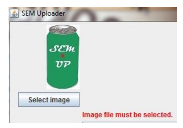
Figure 2. SEM Uploader message if a NON-image file (JPG, PNG, or TIF) is selected.

If the user selected a file that has no metadata .txt file the following error message will appear (Figure 3):