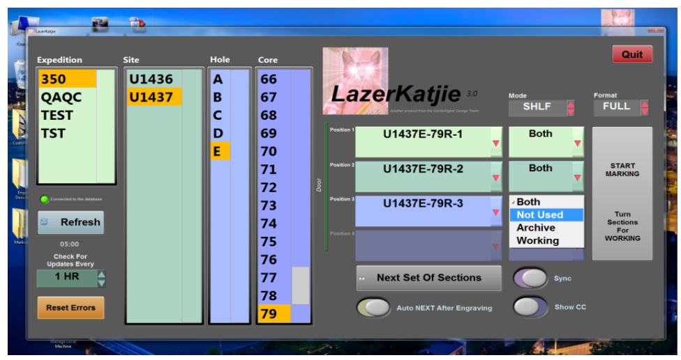
Figure 4. Specifying Mode: Archive, Working, Both or if the position is Not Used from drop down menu.