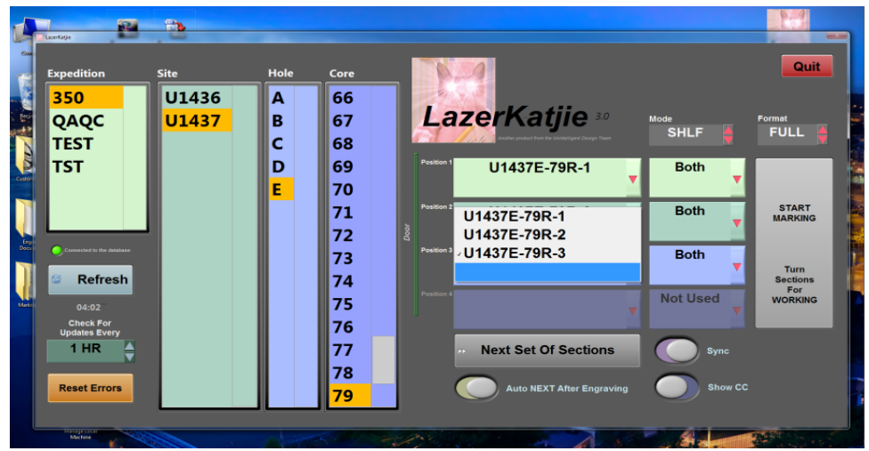
Figure 3. Specifying section position in the engraver from drop down menu.