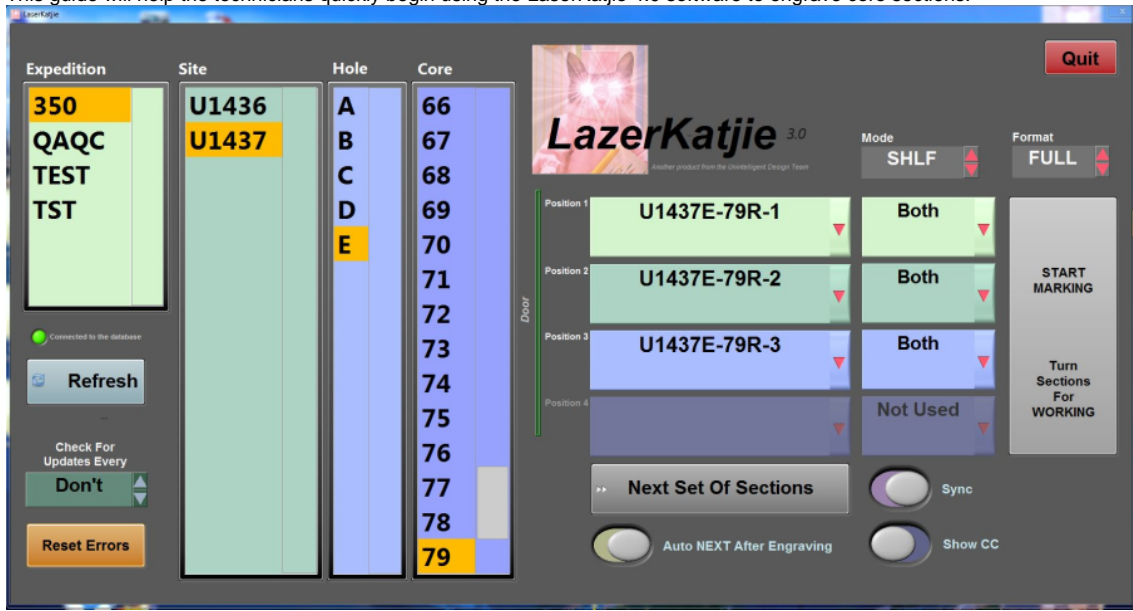
Figure 1. LazerKatjie 4.0 Main Screen.

This guide will help the technicians quickly begin using the LaserKatjie 4.0 software to engrave core sections.