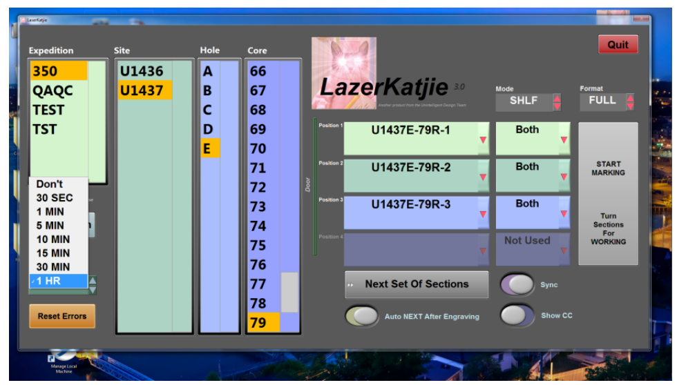
Figure 2. Automatic Update Options (red box in lower left corner).