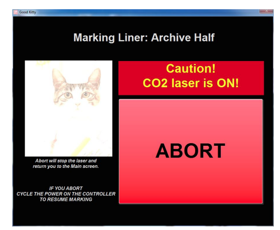
Figure 12. Marking Liner: Archive Half Abort button