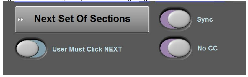
Figure 9. Optional settings for specific cases.