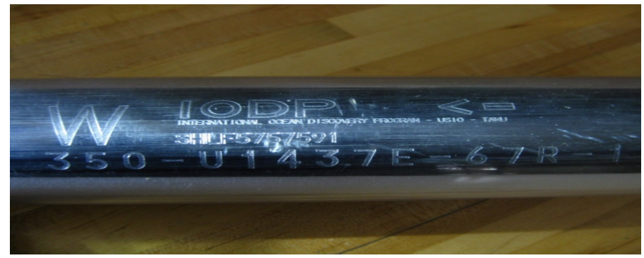
Figure 5. Full format engraving for a section half.