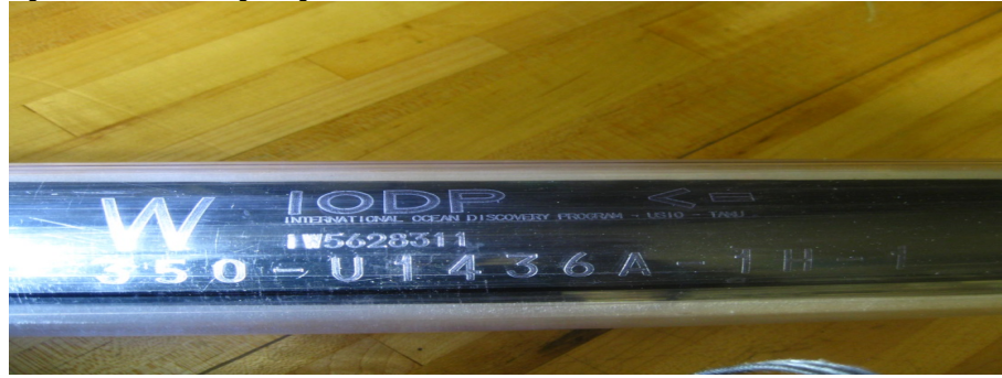
Figure 6. Full format engraving for an interstitial water whole round sample.