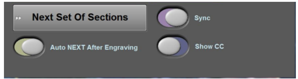
Figure 8. Default settings for quick automatic engraving on section halves.