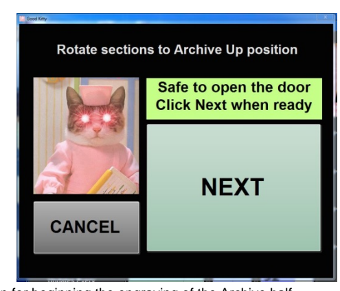
Figure 10. Marking Liner: Working Half Abort window.